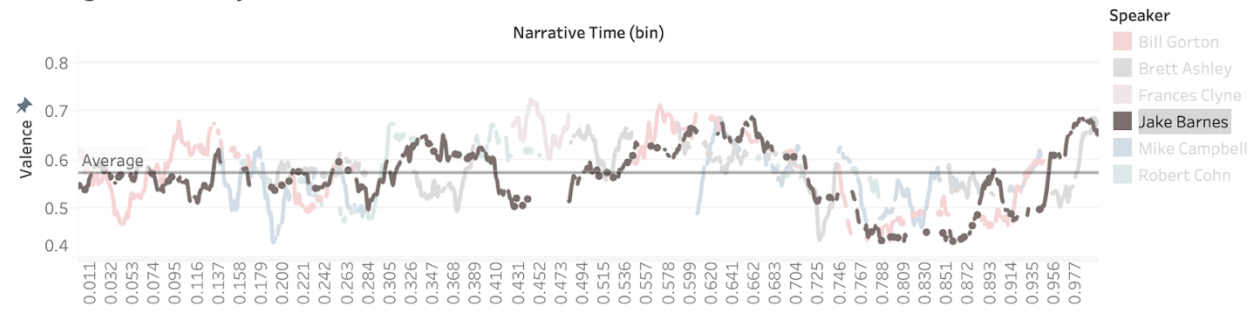
Figure 3. Emotion dynamics, valence only, for all characters in PDNC. Jakes Barnes's trajectory (highlighted) is extreme in the context of the characters in our corpus.