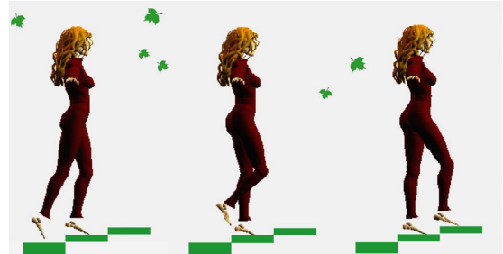
Figure 1. A synthesized stair-ascending motion.

We have introduced the concept of decomposing human motion data into motion signature and action elements. These elements are useful in the synthesis of novel motions for the animation of articulated characters.