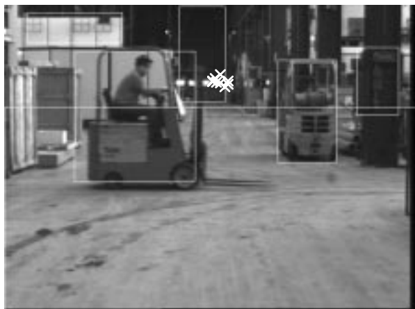
Figure 1: This is a frame from a sequence (of 10 frames) collected by a robot-observer translating roughly along the optical axis in an industrial environment. The forklift and its driver are translating to the right. The boxes indicate image regions for which affine or rational models for optic flow have been fitted. The focus-of-expansion (FOE) of the background motion for each frame in the sequence have been indicated by a 'x' (see Section 5)

velocities, and hence achieve improved optic flow estimates. Their method allows shared ownership of constraints amongst regions. Wang & Adelson [17] segmented image regions into patches whose optic flow at any point could be modelled as an affine transformation of the image coordinates of that point. The segmentation was achieved using a K-means approach. These methods do segmentation in 2-D, and attempt to solve the problem of proper integration of constraints.